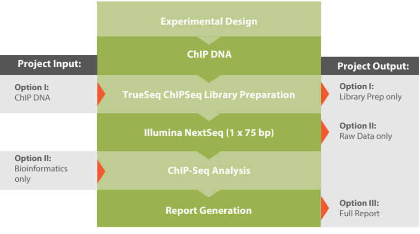
Figure 2. Microsynth's workflow for ChIP-Seq projects. It lists all possible input and output points.

Figure 1. Typical ChiP-Seq Workhow: DNAprotein complexes are stabilized by crosslinking, while unprotected DNA is fragmented and remaining DNA-protein complexes of interest are immunoprecipitated with specific antibodies. Furthermore, DNA is isolated, purified and then subjected to NextGen sequencing followed by thorough bioinformatics analysis.